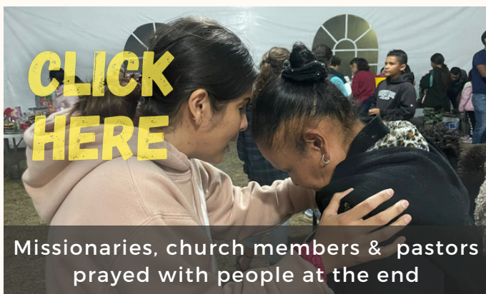
Missionaries, church members & pastors prayed with people at the end

We heard many testimonies, including this one: "I thank God for letting me see Jesus through the people who served. In everyone's tired feet, in the kids that sang although they were tired or hungry, in the broken people who surrendered their lives to God, for the tears that I saw. For so much generosity from the people who left their countries to love Mexico even without knowing the language. Jesus unites us, that is our common language. Being united disciples, disregarding denomination, just loving Him and the lost souls."