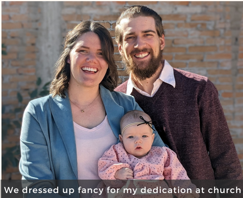
We dressed up fancy for my dedication at church

I would really love to meet each and every one of you, so please reach out to mum and dad so that we can plan a time to get together! We will be in Canada from Feb 1-25, and one of our main goals is to connect with everyone who is a part of our team (you guys!). We would love to go out for coffee, share a meal, or just go for a walk in the snow together and share more of what God has been doing here in Mexico! I can't wait to meet you!!