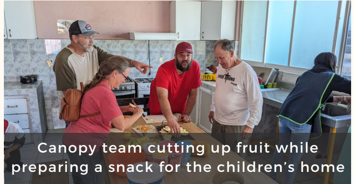
Canopy team cutting up fruit while preparing a snack for the children's home

Each team brings a unique set of skills, abilities, passions, and gifts. If you are interested in bringing a team down, please reach out to us and we'd be more than happy to walk you through the process! We hope to see you soon!