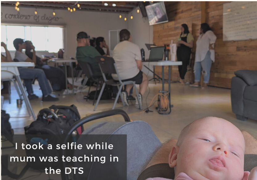
I took a selfie while mum was teaching in the DTS

Mum LOVES DTS. She always talks about how she loves seeing the students go deeper in their relationship with God. I took a sneaky selfie while mum was teaching in the DTS. She taught 1 day about conflict resolution and also a full week on God's redemptive plan.