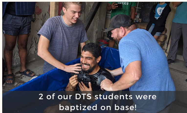
2 of our DTS students were baptized on base!

Therefore go and make disciples of all nations, baptizing them in the name of the Father and of the Son and of the Holy Spirit , and teaching them to obey everything I have commanded you. And surely I am with you always, to the very end of the age."