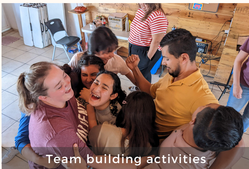
Team building activities

During lecture phase, we have daily class, worship/intercession times, quiet time, and work duties. Once a week the students have a 1-1 conversation with a DTS staff member, and we also have guys and girls small groups to help the students process what they are learning and to walk alongside them in their discipleship process. Every week we also prepare for and serve in a rehab centre and help with children's ministry on base.