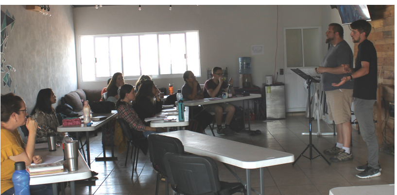
I translated one of our classes on Frontier missions. We learned more about unreached people groups in all parts of the world!

Our last 3 weeks of lecture have had topics that will be particularly useful during our outreach. We learned about Evangelism, Frontier Missions, and Apologetics. All of these themes are focused specifically on making God known , which is one of the main goals of outreach. Previous weeks have been focussed on knowing God , so that we know Who we are sharing!