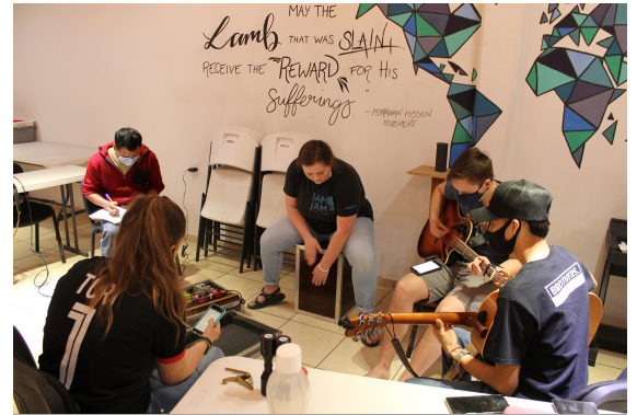
Every Wednesday evening we have a creative night where students can practice and be creative!

One of my main responsibilities in this season is to organize and run the Music focus of our DTS. Our vision for this track is to expand our understanding of how music can be used to glorify God in life, ministry and missions, and to develop well-rounded abilities. I am extremely excited about this opportunity to use my passion and gifts to help raise up and launch the next generation of worshippers, songwriters, warriors, encouragers, music therapists, teachers, and creatives to reach a broken world with the message of the Gospel. In the coming months I will share more about how we are working to accomplish this.