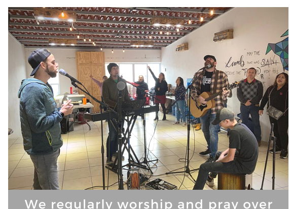
We regularly worship and pray over

Currently I am a student in the SLMD, but that isn't my only responsibility. I often help with leading worship and children's ministry on Wednesdays. Once the SLMD is done, I will be more involved in leading training schools that we run on base. In January I will oversee the Music track of the Discipleship Training School, and also start a missions podcast!