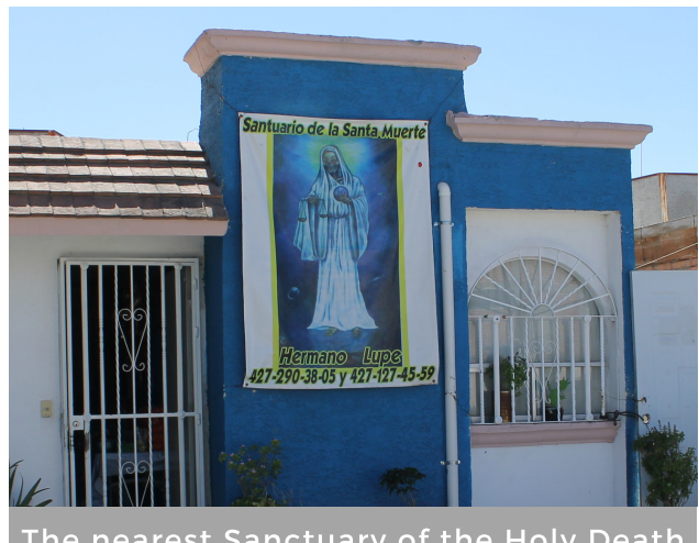
The nearest Sanctuary of the Holy Death is a 1 minute walk from our base.

In Mexico, one of the idols that is worshipped is La Santa Muerte (The Holy Death). Containing elements of Catholicism mixed with Aztec religion, this god is worshipped as one who is accepting, particularly to people who feel rejected by the church. Their worship is not as much a fear of death as it is the embracing of it. With the high quantity of violence and fatalities in Mexico, many people have turned to this idol as a source of comfort. Watch this video for more information (also available on my website)