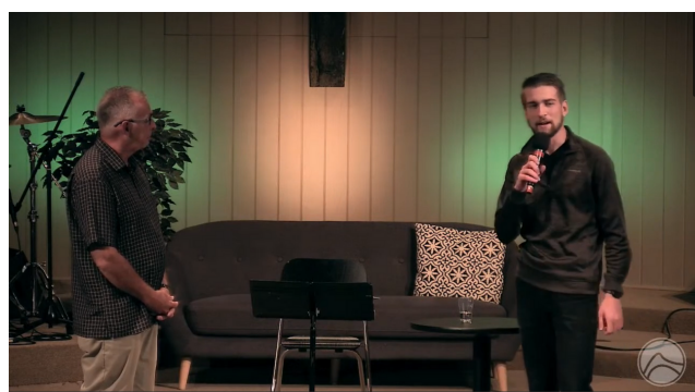
Sharing at Grandview (my home church) on Sunday, September 27

I was blessed last Sunday with the opportunity to update my church family about my plans and they took time to pray for me. It is extremely encouraging to know that, as Christians, we are never alone. Being adopted by God into His family means we have a Heavenly Father who cares and provides for us and it also means that we are surrounded by brothers and sisters in Christ!