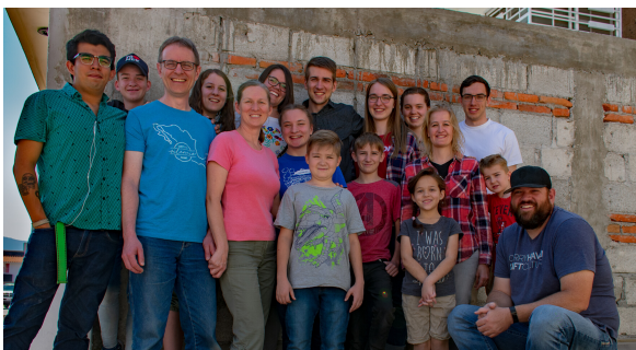
Short term mission with YWAMQ (April 2019)