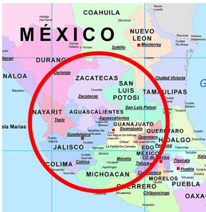
The Circle of Silence