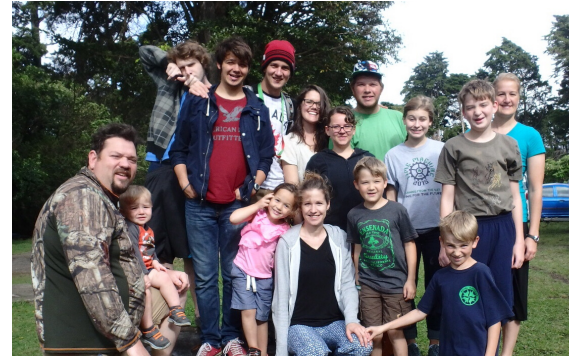
Our DTS outreach team (Dec. 2015)

In September of 2015, I participated in a Music and Missions Discipleship Training School (DTS) run by Youth With A Mission (YWAM) in Ensenada, Mexico. This 5-month program is designed to help students engage with God, grow in their relationship with Him, and then return to their sphere of influence better equipped to engage their community with the Gospel. God did that in my life, and also began to share with me His heart for Mexico.